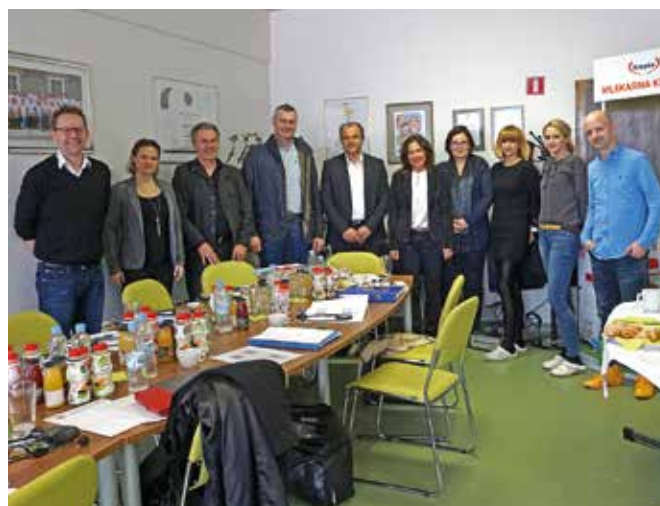
Meeting at Mlekarna Krepko dairy, Slovenia

The local dairy sector which includes many small family businesses is the main focus of the strategy. The entrepreneurs on both sides of the border deal with common challenges in the cross-border region. They are experiencing heavy competition with large multinational players and have difficulties to be competitive due to their remote and mountainous location.