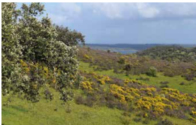
The cross-border region between Portugal and Spain

The full blueprint is available on the Agropol website: www.agropol-events.eu