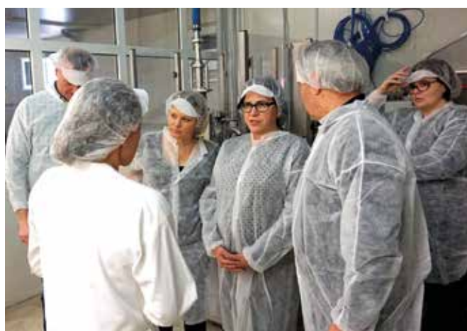
On-site visit, Carinthia/Slovenia cross-border Agropol meeting

A “learning-by-doing-approach” including different actors along the “value chains” based on agriculture and food was applied. The experiences from these pilot activities serve as a benchmark for a cross-border agro-food cooperation model which can be transferred to other regions in Europe.