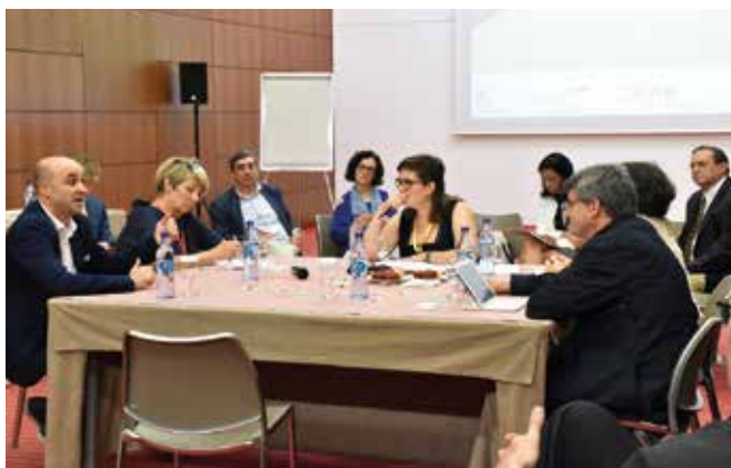
Agropol workshop, Oeiras, Lisbon, October 2017

The cooperation should build on existing cluster initiatives or cross-border structures such as a Euroregion or European Grouping of Territorial Cooperation (EGTC).