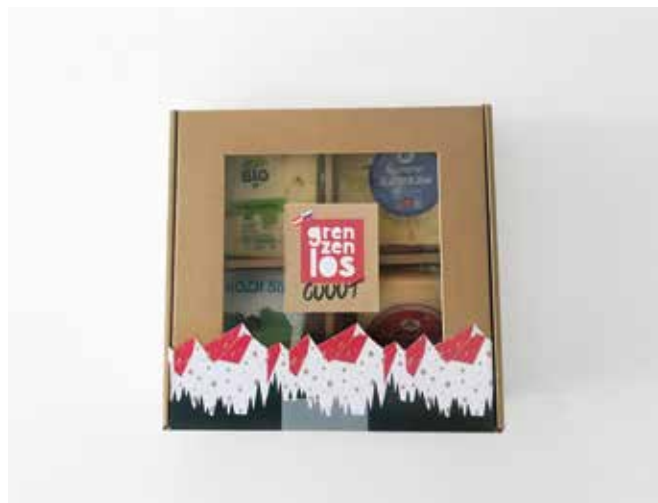
Grenzenlos Guuut cheese box

In the dairy sector, the Alpe Adria cheese box was developed including organic cheese from Carinthia and Slovenia, wrapped up in a joint packaging under one cross-border brand. The production costs are shared by one Carinthian and one Slovenian dairy and the boxes will be sold online or through traditional distribution channels.