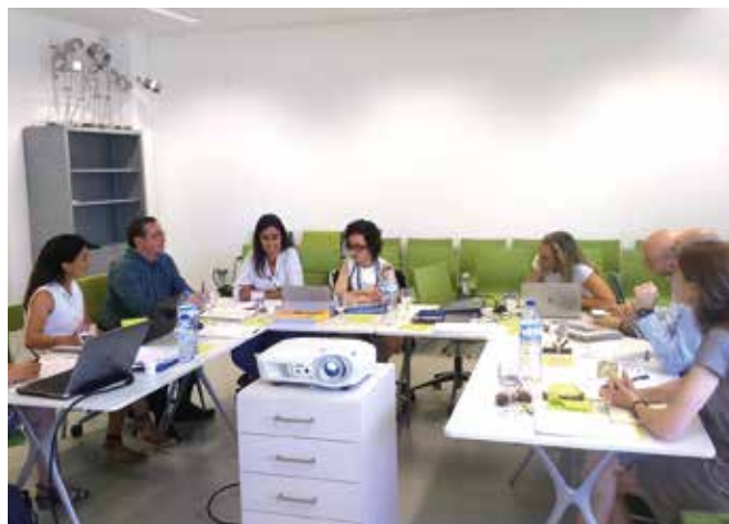
EUROACE Alentejo/Centro/ Extremadura cross-border Agropol meeting

In close cooperation with regional authorities and local actors, the project partners conducted an in-depth study on existing cooperation activities and potential business areas where cross-border activities could be of mutual benefit. They also developed a common cross-border cooperation strategy for the agro-food sector in the case regions.